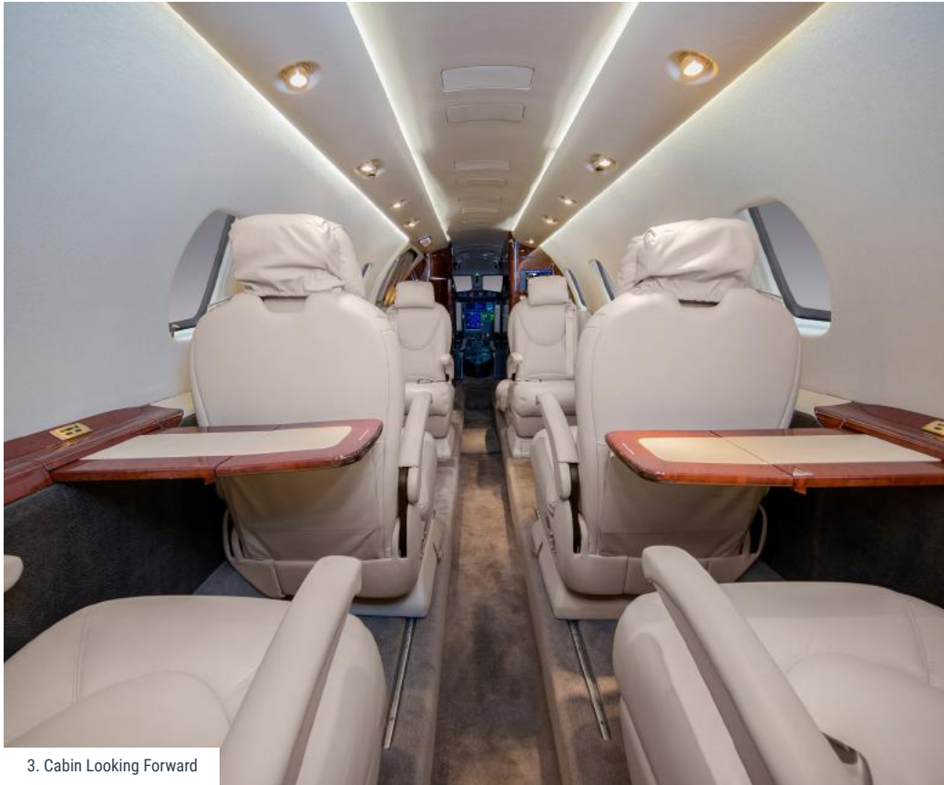
3. Cabin Looking Forward