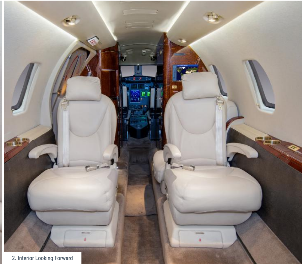
2. Interior Looking Forward