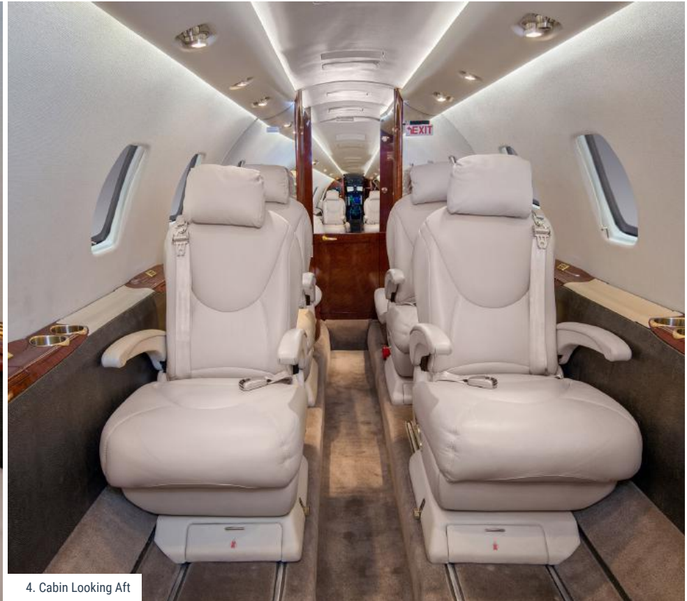
4. Cabin Looking Aft