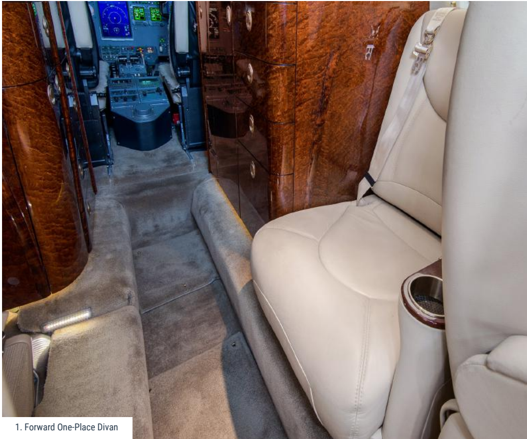
1. Forward One-Place Divan