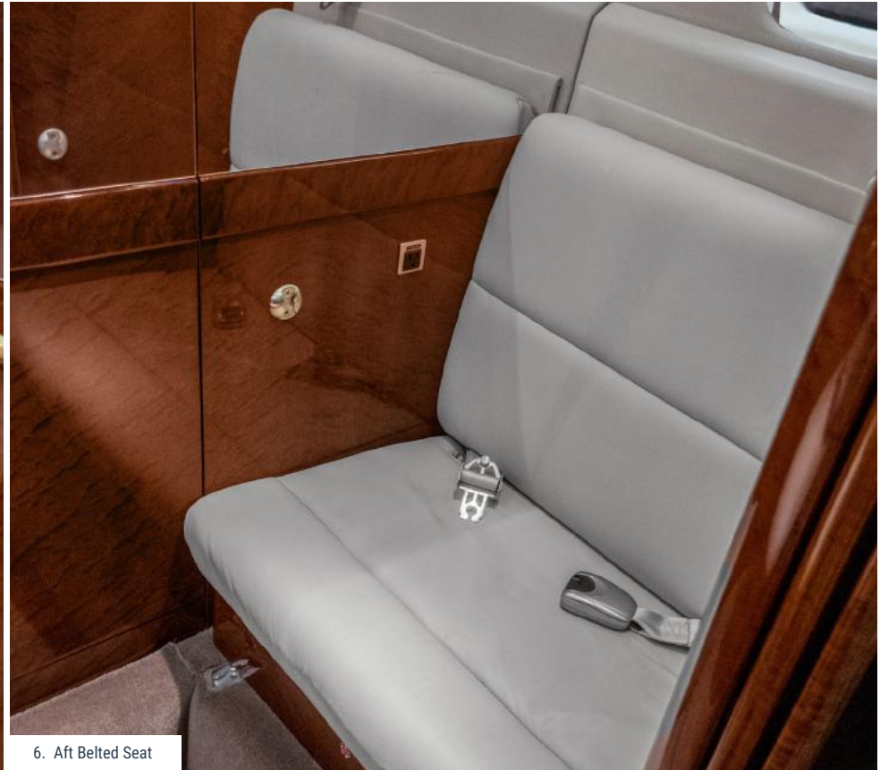
6. Aft Belted Seat