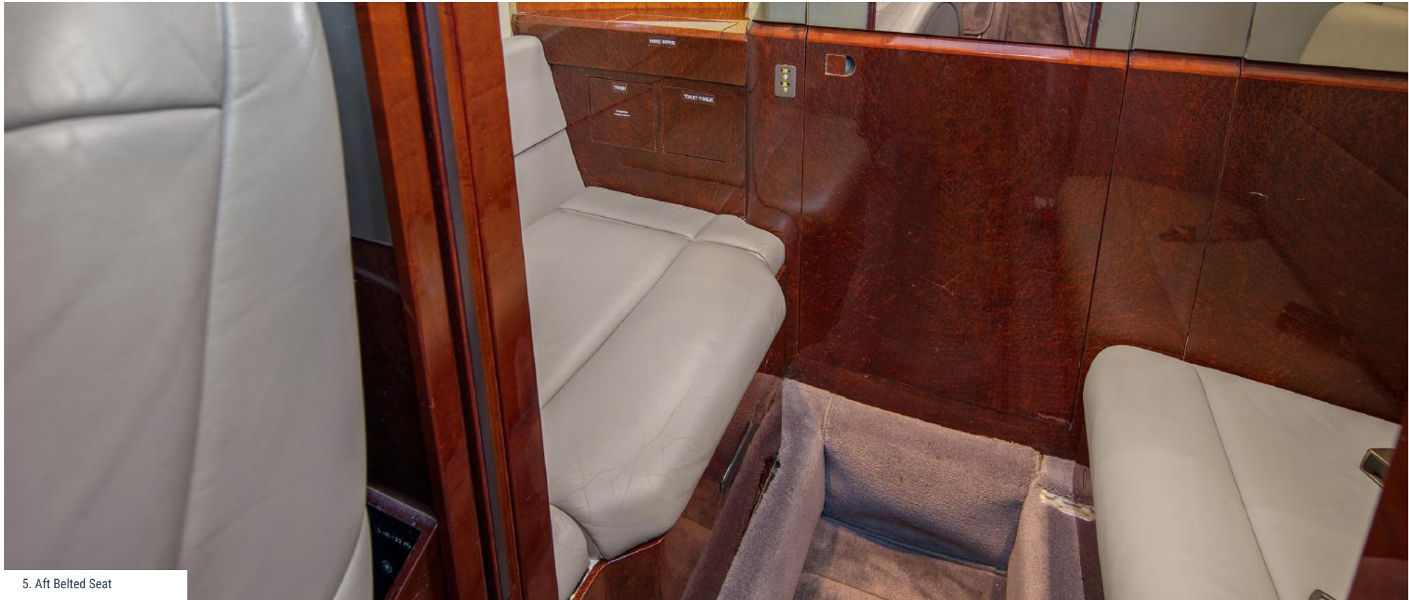
5. Aft Belted Seat