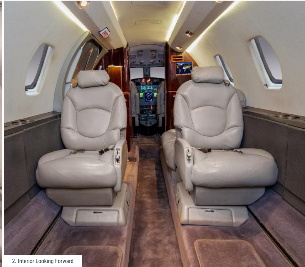
2. Interior Looking Forward