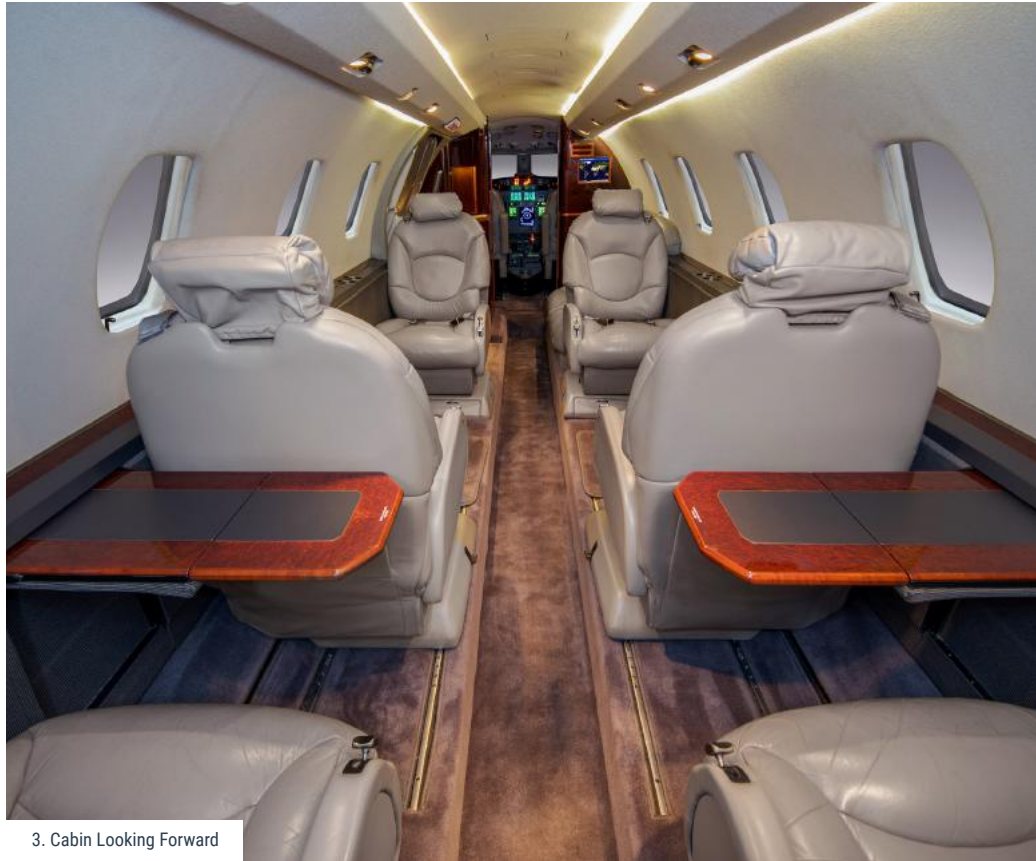
3. Cabin Looking Forward