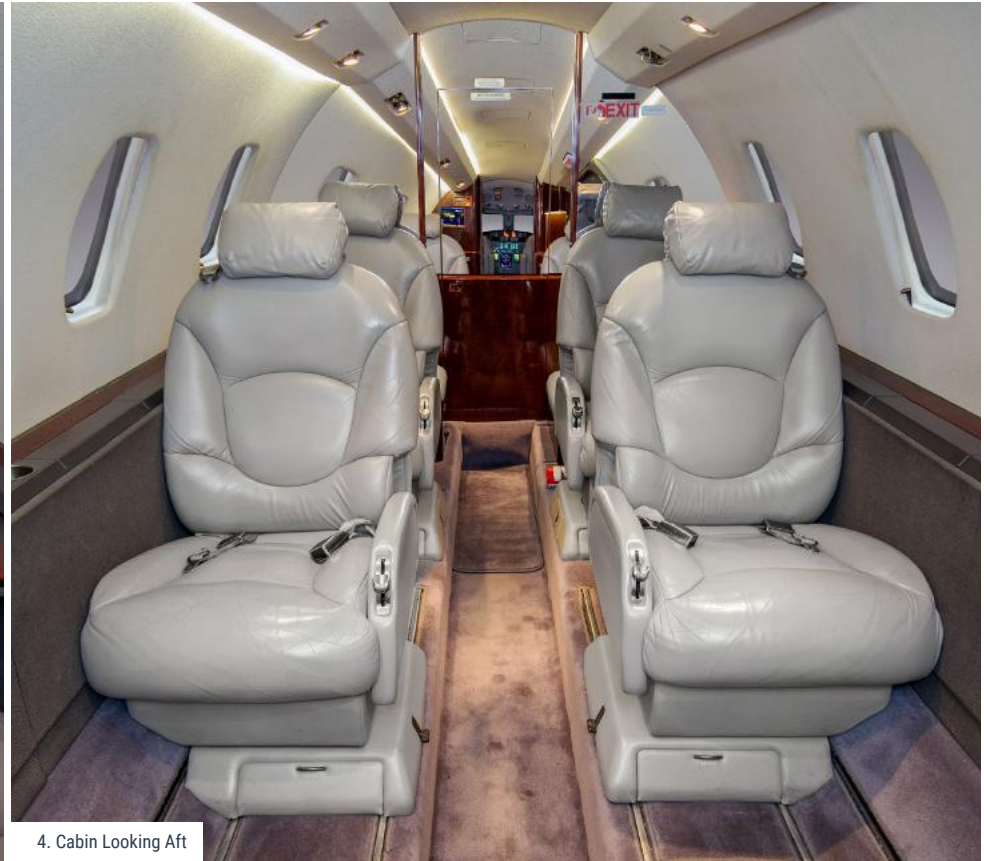
4. Cabin Looking Aft