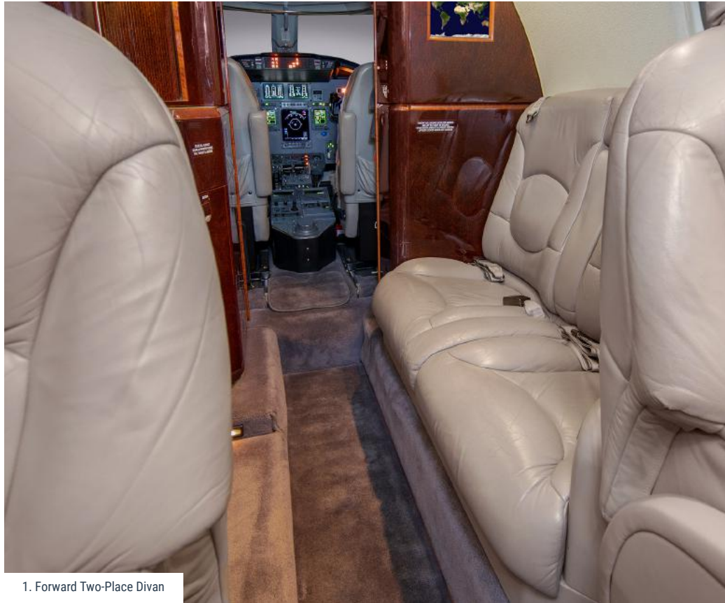
1. Forward Two-Place Divan