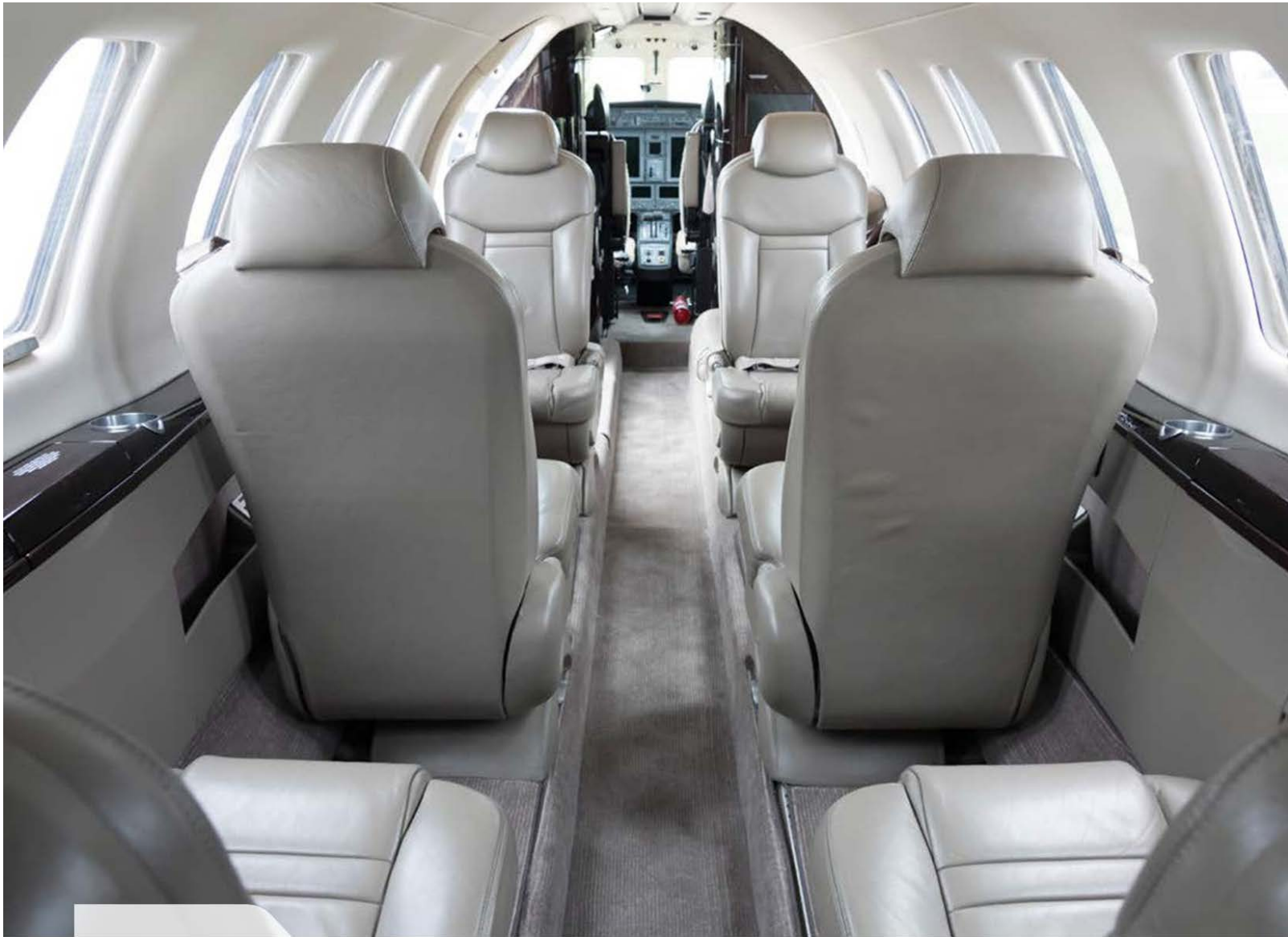
Forward Area Looking Forward