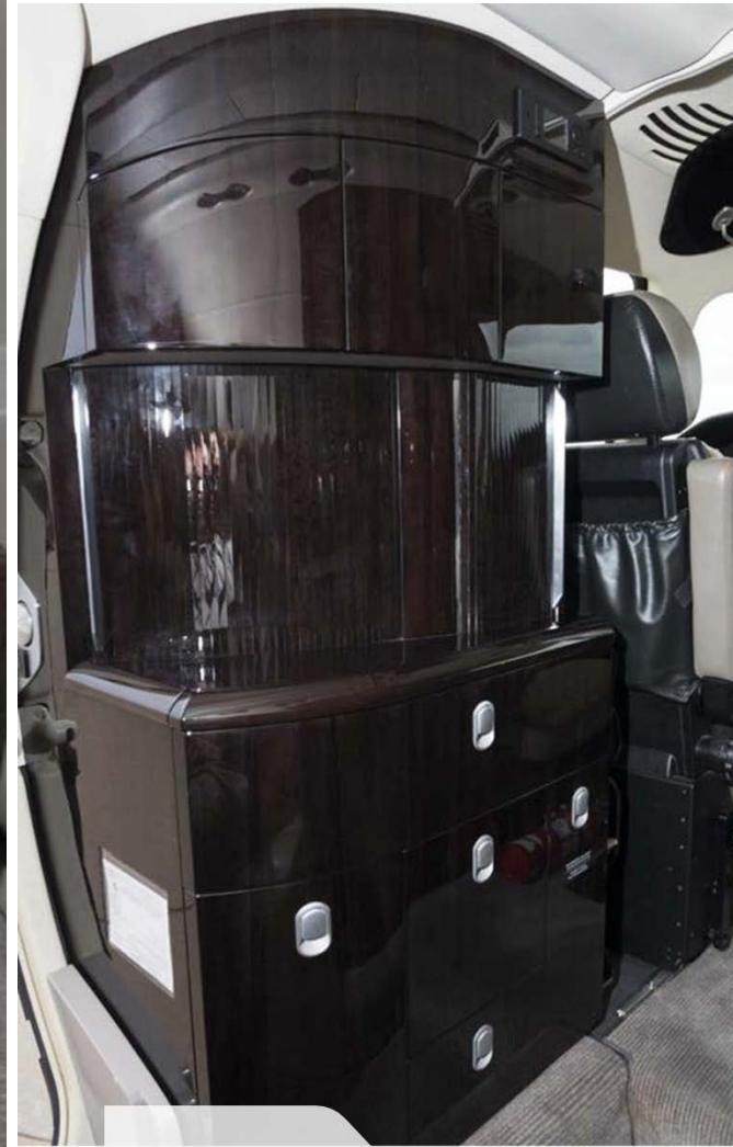
Forward Seat and Galley