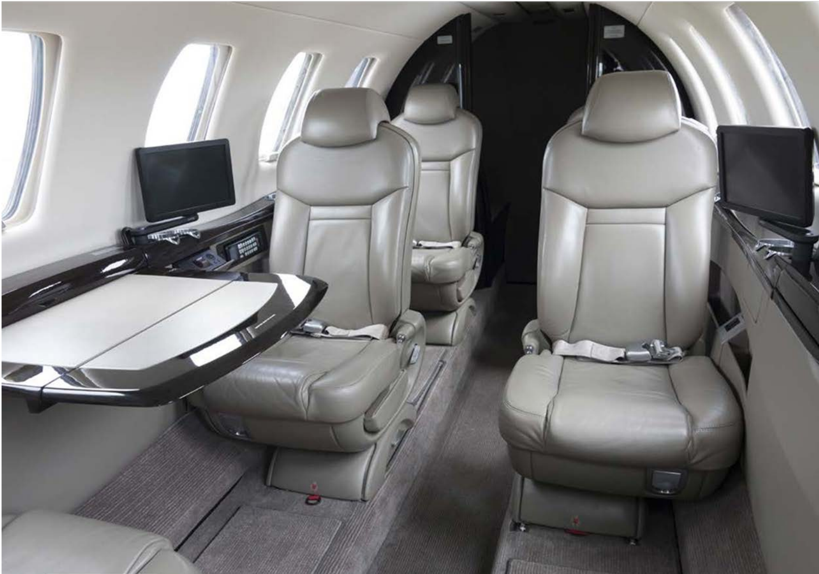
Forward Area Looking Aft